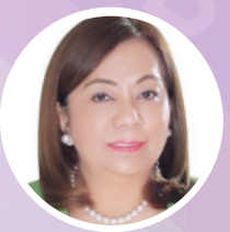
Angelita M. Ang Fellowship and Sunshine Chair